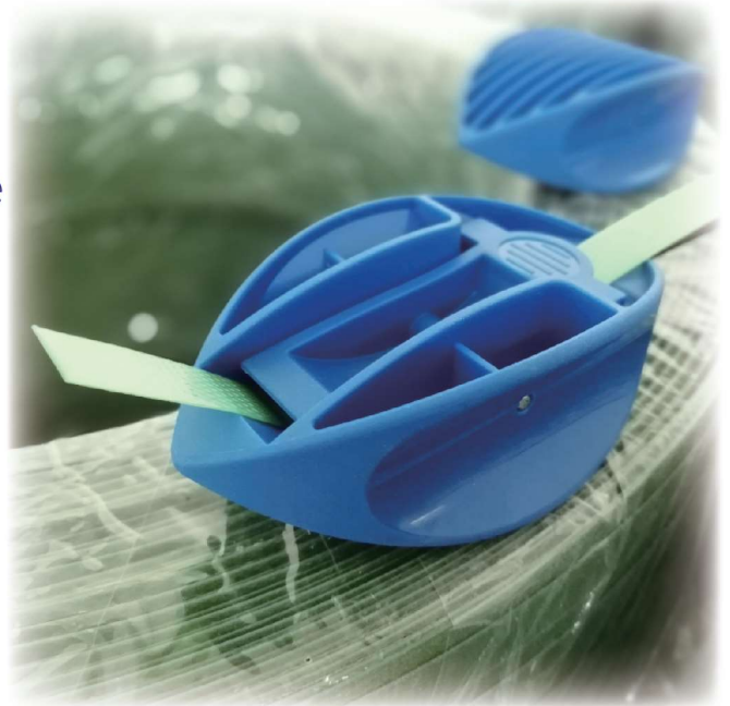
Durable and flexible, less stopping and kneeling action

Blue-Sword threading tools is a professional auxiliary tool for pallet threading. It is designed for PET,PP and other straps. Its high efficiency and durability enable users to feed the straps under and through the pallets while standing comfortably, which is also more energy-saving and safer.