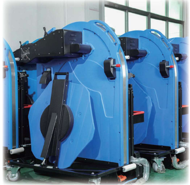
Easy operation, ergonomic, efficient, affordable, especially for pallet packing

JD-008 Ergonomic pallet strapping machine with electrically driven chainlance via motor is a hot product in all industry. It can make you have an elegant way of strapping without bending down, which is a comfortable way by one person from one side only just roll the strapping machine in front of the pallet. Then the ChainLance pulls the strap through under the pallet and up again on the rear side and over the pallet. The strap is tensioned and welded securely by sealing head.